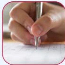
Aggressive & Board Specific Test Pattern