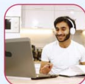
All Time Doubt Solving Facilities