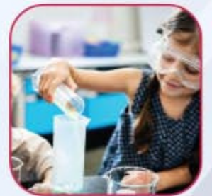
Live Laboratory Set Up & Experiment based Learning