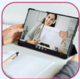
SMART & Comprehensive Study Material