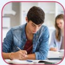
3.5 hrs of daily Classroom Session