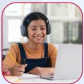
Unlimited Worksheets & Test Papers Repository