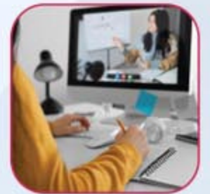
Free Access to Pre Recorded Video Lectures