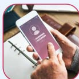
Real Time Performance Tracking App