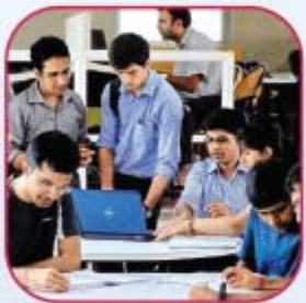
Small Batch Size