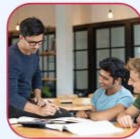
Expert Board Specific Faculties with 8+Years Of Experience